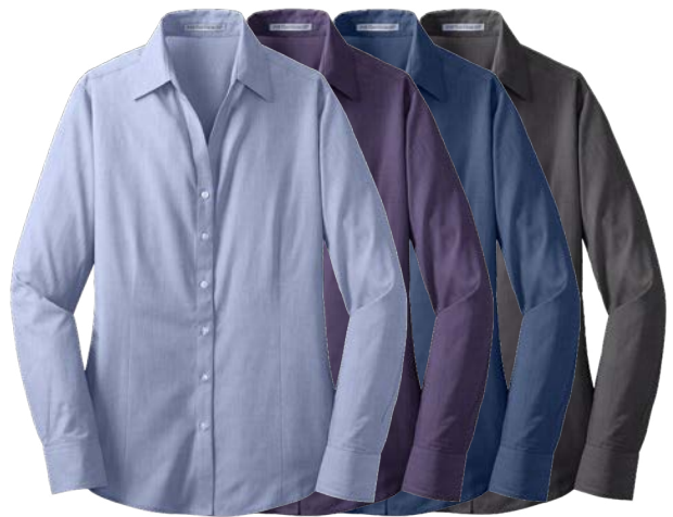
PORT AUTHORITY Ladies Crosshatch Easy Care Shirt L640 Women's Sizes: XS-4XL | 4 colors