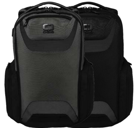
OGIO Connected Pack 91008 2 colors