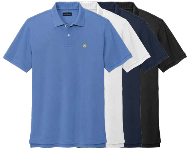
BROOKS BROTHERS Pima Cotton Pique Polo BB18200 Adult Sizes: XS-4XL | 6 colors