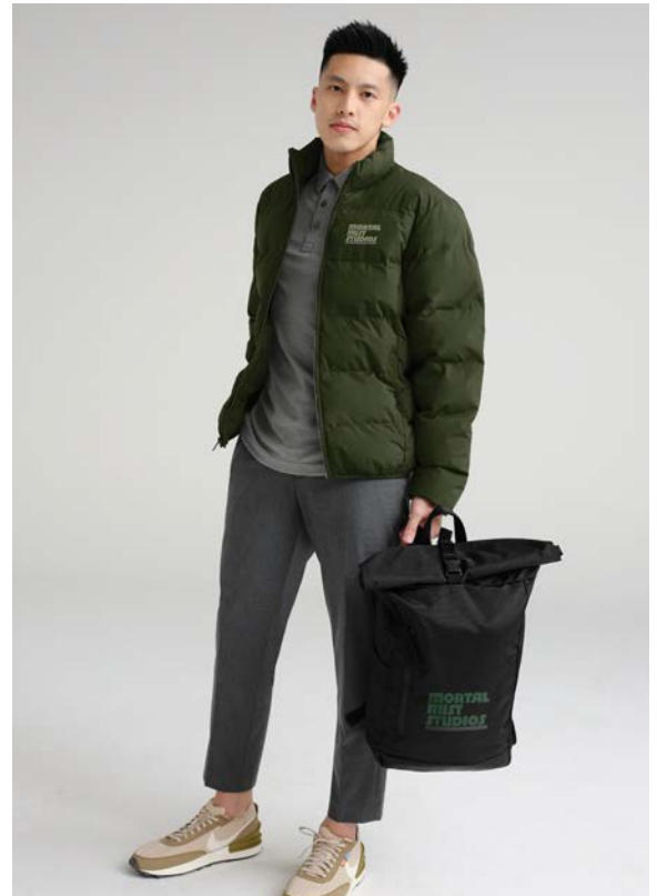
MERCER + METTLE Rucksack MMB201 One Size Fits All | 1 color Worn with TM1MU412, MM7210