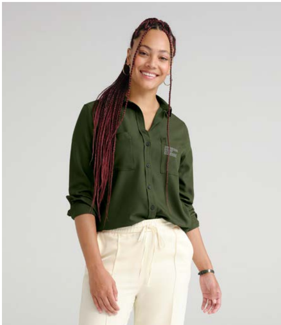
MERCER + METTLE Women's Stretch Crepe Long Sleeve Camp Blouse MM2013 Women's Sizes: XS-4XL | 4 colors