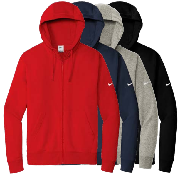
NIKE Club Fleece Sleeve Swoosh Full-Zip Hoodie NKDR1513 Adult Sizes: XS-4XL | 6 colors