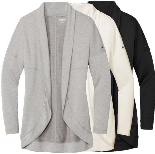
OGIO Ladies Luuma Coccoon Fleece LOG811 Women's Sizes: XS-4XL | 3 colors