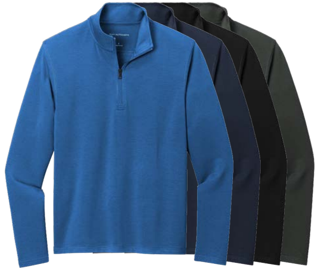
PORT AUTHORITY Microterry 1/4-Zip Pullover K825 Adult Sizes: XS-4XL | 4 colors