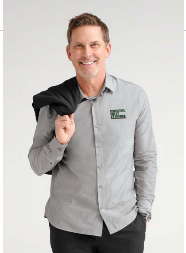
MERCER + METTLE Long Sleeve Stretch Woven Shirt MM2000 Adult Sizes: XS-4XL | 7 colors Worn with TM1MW453