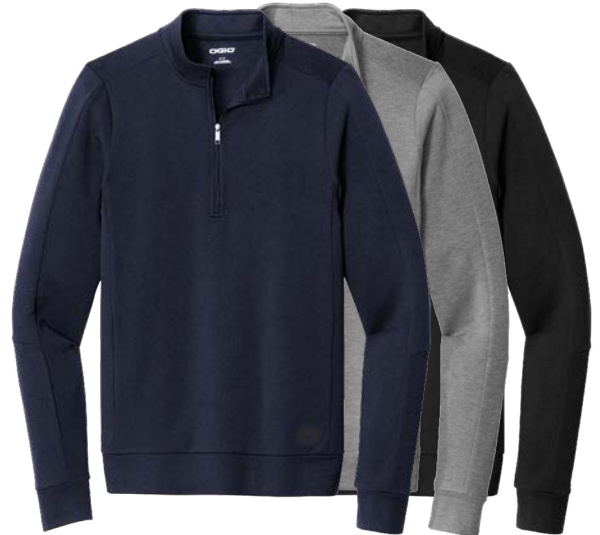
OGIO Luuma 1/2-Zip Fleece OG813 Adult Sizes: XS-4XL | 3 colors