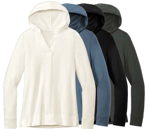
PORT AUTHORITY Ladies Microterry Pullover Hoodie LK826 Women's Sizes: XS-4XL | 4 colors