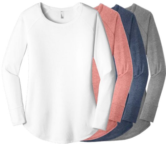
DISTRICT Women's Perfect Tri Long Sleeve Tunic Tee DT132L Women's Sizes: XS-4XL | 5 colors

Uplift the whole team with outfits that speak to a cohesive vision, a laid-back attitude and a clear focus on accomplishing great work together.