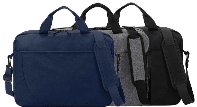
PORT AUTHORITY Access Briefcase BG318 3 colors