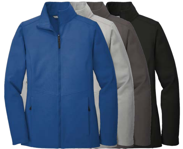
PORT AUTHORITY Ladies Collective Soft Shell Jacket L901 Women's Sizes: XS-4XL | 5 colors