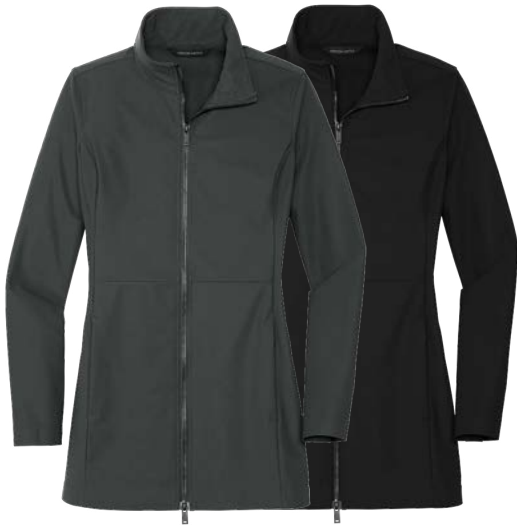
MERCER + METTLE Women's Faile Soft Shell MM7101 Women's Sizes: XS-4XL | 2 colors