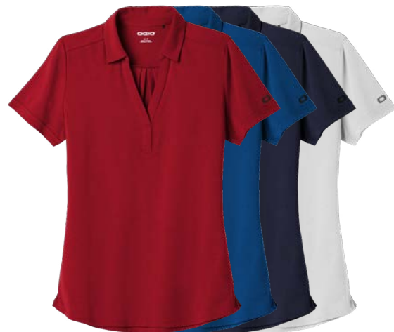
OGIO Ladies Limit Polo LOG138 Women's Sizes: XS-4XL | 7 colors