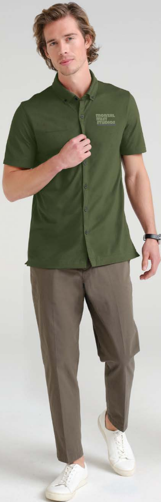
MERCER + METTLE Stretch Pique Full-Button Polo MM1006 Adult Sizes: XS-4XL | 7 colors