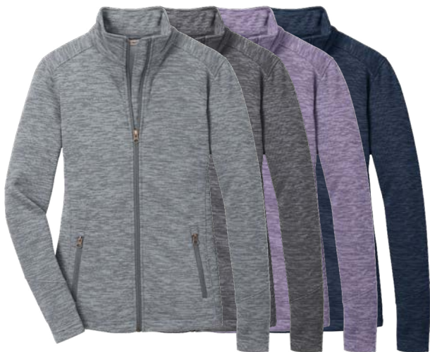
PORT AUTHORITY Ladies Digi Stripe Fleece Jacket L231 Women's Sizes: XS-4XL | 4 colors