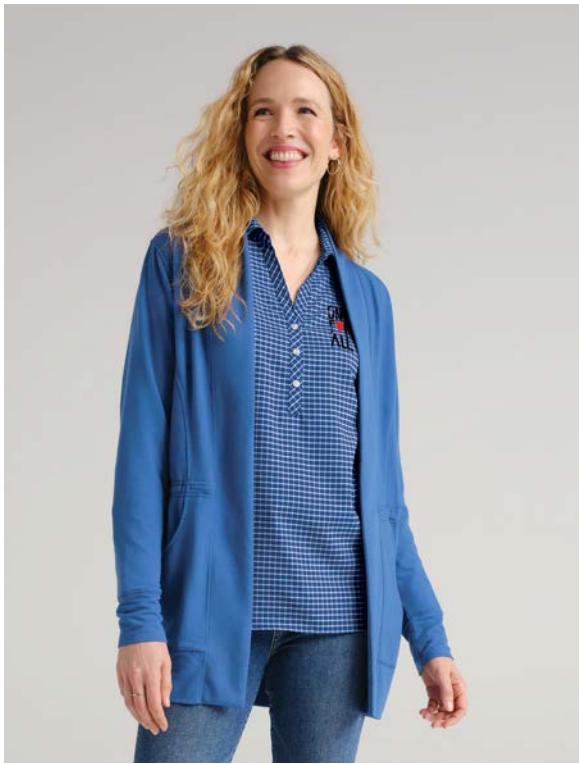
PORT AUTHORITY Ladies Microterry Cardigan LK825 Women's Sizes: XS-4XL | 4 colors Worn with LW680