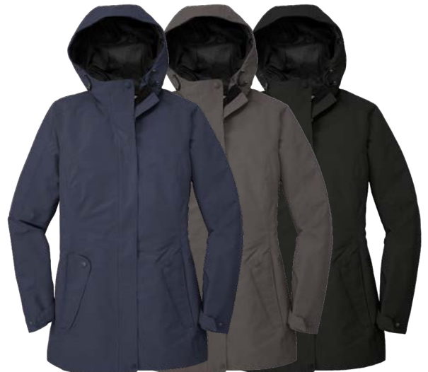
PORT AUTHORITY Ladies Collective Outer Shell Jacket L900 Women's Sizes: XS-4XL | 4 colors