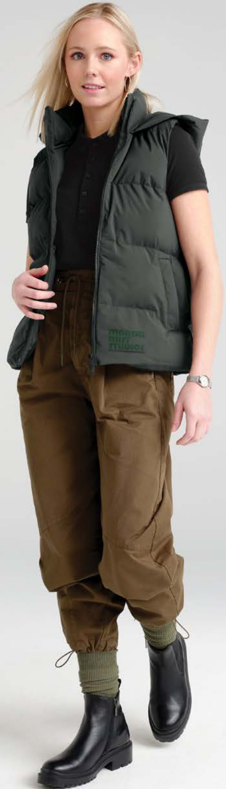
MERCER + METTLE Women's Stretch Heavyweight Pique Polo MM1001 Women's Sizes: XS-4XL | 8 colors