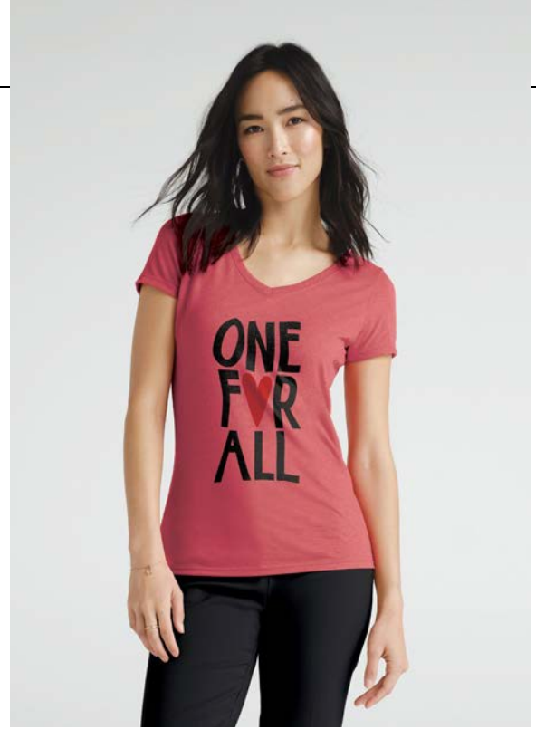
DISTRICT Women's Perfect Tri V-Neck Tee DM1350L Women's Sizes: XS-4XL | 23 colors