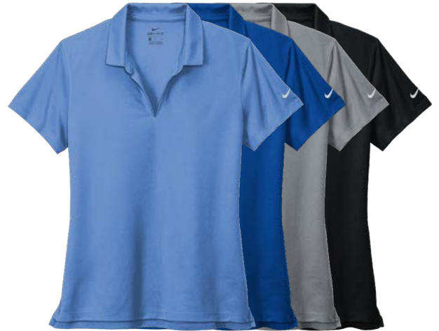
NIKE Ladies Dri-FIT Micro Pique 2.0 Polo NKDC1991 Women's Sizes: S-2XL | 20 colors