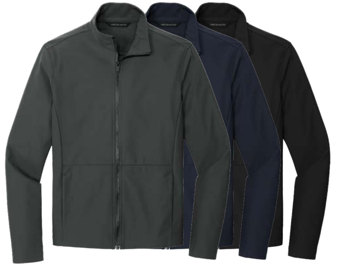
MERCER + METTLE Faile Soft Shell MM7100 Adult Sizes: XS-4XL | 3 colors