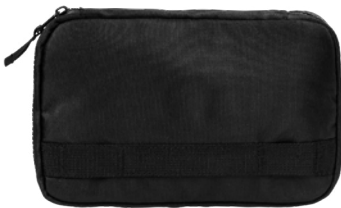
MERCER + METTLE Utility Case MMB700 1 color