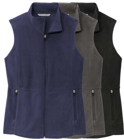
PORT AUTHORITY Ladies Accord Microfleece Vest L152 Women's Sizes: XS-4XL | 3 colors