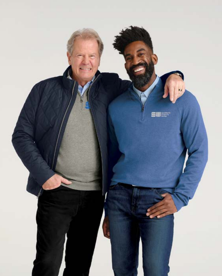
BROOKS BROTHERS Cotton Stretch 1/4-Zip Sweater BB18402 Adult Sizes: XS-4XL | 4 colors