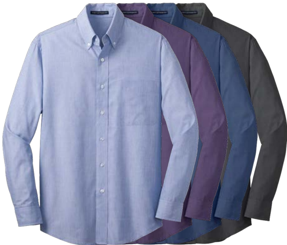
PORT AUTHORITY Crosshatch Easy Care Shirt S640 Adult Sizes: XS-4XL | 4 colors