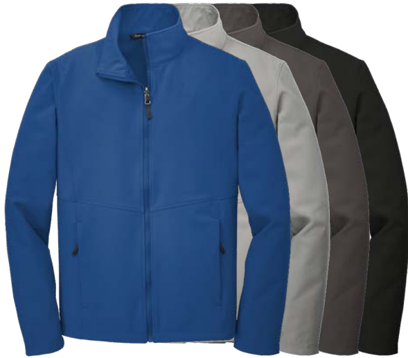
PORT AUTHORITY Collective Soft Shell Jacket J901 Adult Sizes: XS-4XL | 5 colors