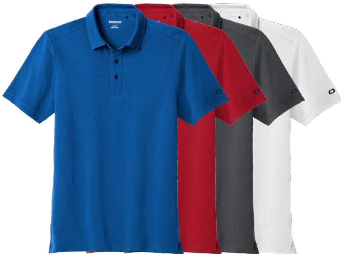
OGIO Limit Polo OG138 Adult Sizes: XS-4XL | 6 colors