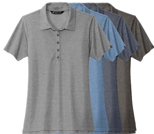
TRAVISMATHEW Ladies Oceanside Heather Polo TM1WW002 Women's Sizes: S-2XL | 6 colors