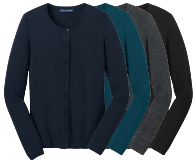
PORT AUTHORITY Ladies Cardigan Sweater LSW287 Women's Sizes: XS-4XL | 3 colors