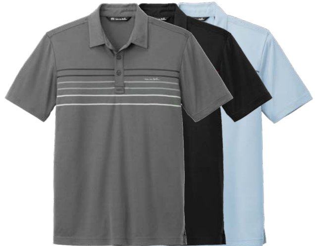
TRAVISMATHEW Coto Performance Chest Stripe Polo TM1MY400 Adult Sizes: S-3XL | 3 colors